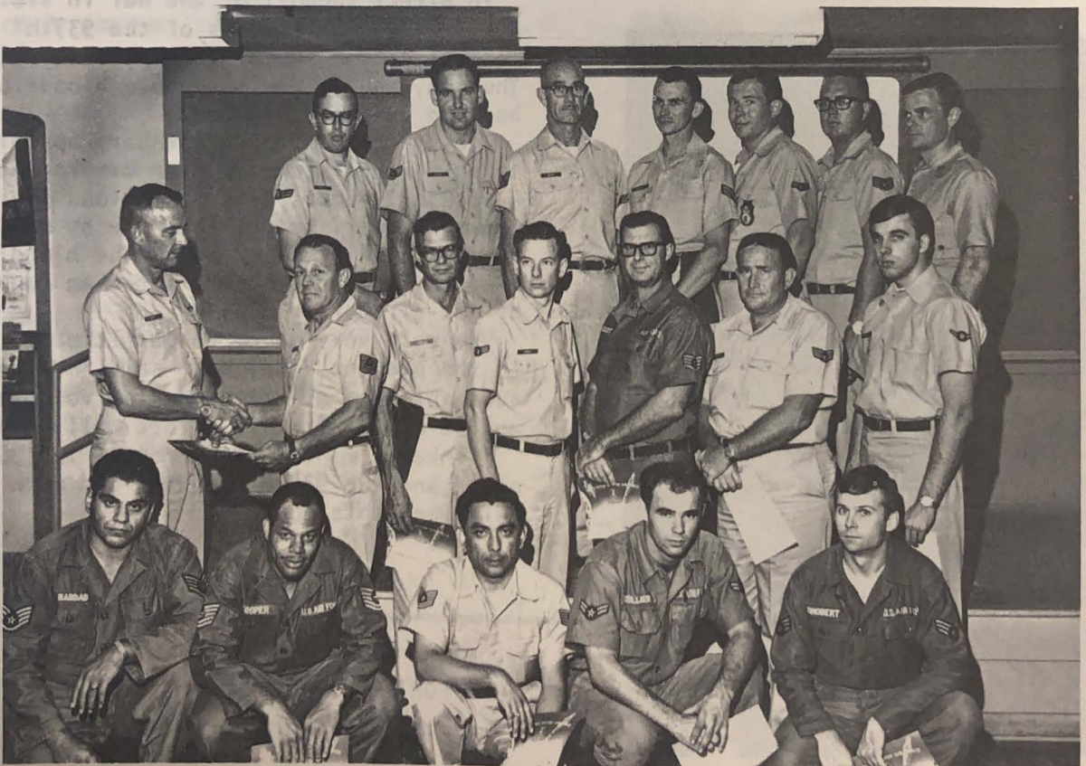
COL HUFF CONGRATULATES OJT SUPERVISORS ON THE COMPLETION OF THEIR COURSE.

The SOONER NEWS is a monthly publication and opinions expressed herein do not necessarily represent those of the United States Air Force.