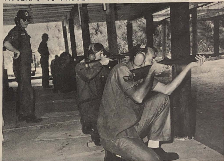
"READY ON THE RIGHT...READY ON THE LEFT ...READY ON THE FIRING LINE"--ECHOED THROUGH THE FIRING AREA AS PERSONNEL QUALIFY WITH THE M-1 CARBINE.